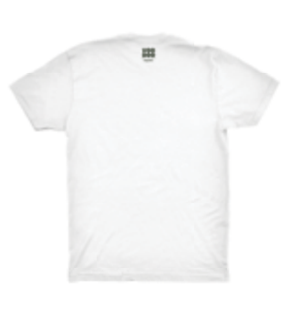
ORGANIC TEE S - M - L - XL - XXL

Certified as per the Global Organic Textile Standard (GOTS).